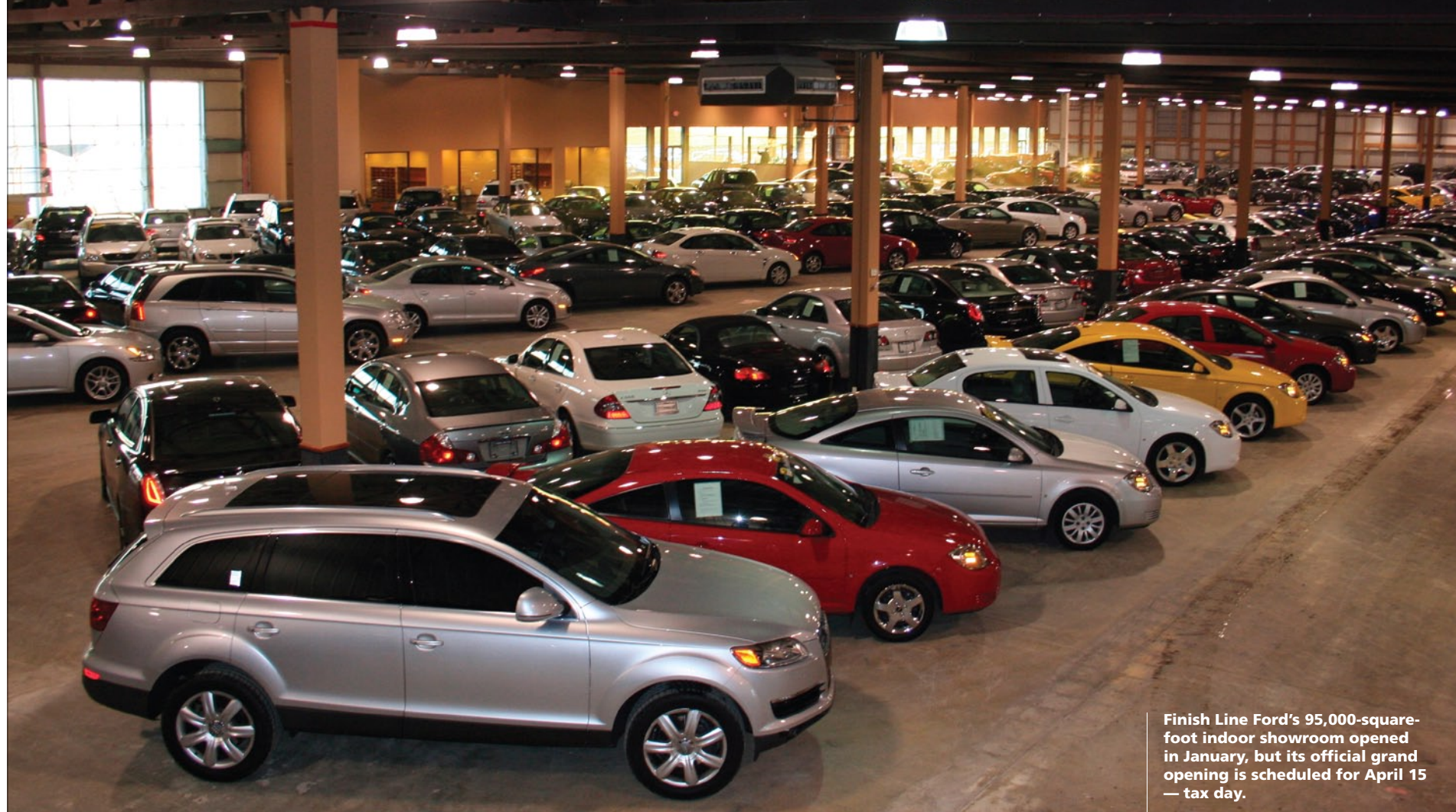
Finish Line Ford's 95,000-square-foot indoor showroom opened in January, but its official grand opening is scheduled for April 15 — tax day.